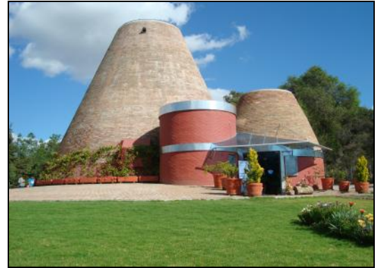
Tickell Theatre in Flor del Bosque Educational Park

Two more Tickell Network Climate Theatres are scheduled to open elsewhere in Mexico later in 2012, respectively in Chetumal, capital of the State of Quintana Roo, and Oaxaca, capital of the State of Oaxaca, and others in Mexico seem likely in 2013 and beyond. It is possible by the end of 2012 that the Tickell Network Climate Theatres, the climate education equivalent of a planetarium, will be approaching a million visitors annually, with each visitor receiving a multimedia presentation roughly 40 minutes in length. The remarkable success of the Tickell Network Theatres in Mexico has stimulated interest in extending this model elsewhere in Latin America, Europe, the Middle East, Southeast Asia, and South Asia.