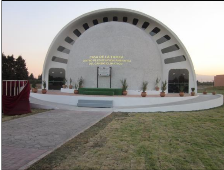
Casa de la Tierra Climate Theatre in Metepec, Mexico

activism that cut across the political spectrum. Although there are undoubtedly a number of factors that enabled Mexico to leapfrog past its two Northern neighbors in both public awareness of climate change and policymaker response to it, significant credit goes to a few Mexican