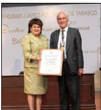
Sir Crispin Tickell receives honorary degree from UJAT