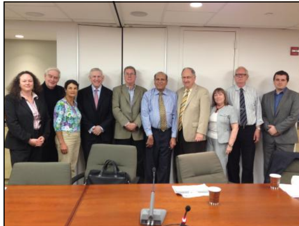
ACAR Steering Committee Meeting May 2012 in Washington DC

The ACAR has identified several areas in which to focus its efforts: shipping, trucking, airlines, mining, forest and grass fire mitigation, agriculture, energy, and industrial development. Several of these areas already have technology to reduce emissions, but are lacking the proper motivations and incentives. Other forms of mitigation are in the development process, and the ACAR is pursuing data collection and research in order to identify and further develop such techniques. While many of these projects may have only minor impacts, and the scope of the