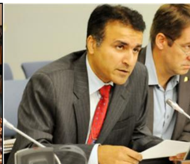
Nasir Khattak speaks to Special Session on Small Island Developing States of the UN General Assembly

transformation goals. 2) invites and mobilizes the private sector and finance community to play a more active role and invest in the commercial opportunities, 3) calls for increased coordination and collaboration among the existing implementing agencies, such as UN agencies, regional organizations and NGOs that are working in the energy sector in the Small Island Developing States.