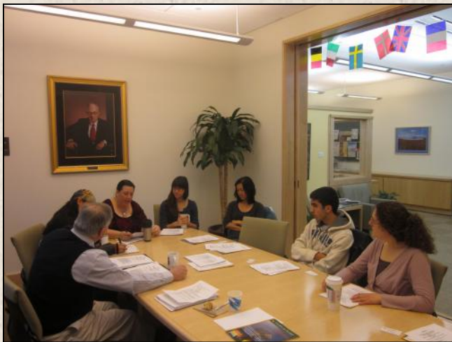
Center for Environmental Leadership Training (CELT) Meeting

To complement the Tickell Climate Theatres and to reach many who are not near such theatres the Climate Institute is working through its educational arm, the Center for Environmental Leadership Training (CELT) in Hanover, NH, to gather, develop and test problem solving tools, educational games and short summaries of climate innovations in Spanish, English and Chinese and ultimately French and Portuguese as well. Although CELT is in its infancy and is today a virtual center drawing largely on talents of undergraduates and graduate students at Dartmouth College, it seeks to develop problem solving games and educational tools that can be used both within climate theatres within the Tickell Network and much more broadly- on the internet and on social networking sites.