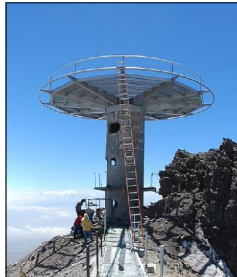
Sir Crispin Tickell High Altitude Observatory

SIMA soon after that began to function as the Climate Institute's principal partner in Mexico. Within about three years it revised its priorities to focus on the creation of a climate observatory much like that at Mauna Loa in Hawaii. The SIMA team obtained the necessary approvals from the World Meteorological Organiza-