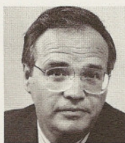
James Gustave Speth

J ames Gustave (Gus) Speth, former President of the World Resources Institute (WRI) in Washington, D.C., has succeeded William H. Draper III as the new Administrator of the United Nations Development Programme. UNDP is the world's largest multilateral source of grant technical assistance, with offices in 124 developing countries. After the announcement of his appointment to UNDP, Mr. Speth stated, "A UN agenda for development is an essential complement to its agenda for peace. I want UNDP to contribute to making peace possible by helping people attack, not each other, but the deprivation and disparities that are among the root causes of conflict."