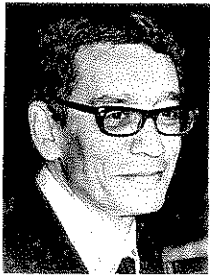
H.E. Boutros Ghali

LUNCHEON SPEAKER: Amb. Stephen Lewis, Chair, 1988 Toronto Conference