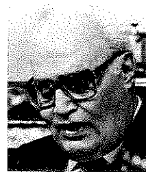
H.E. Dr. Atef Sidky

CONCLUDING SESSION: 5:30 p.m.: Speech by H.E. Dr. Atef Sidky, Prime Minister of Egypt