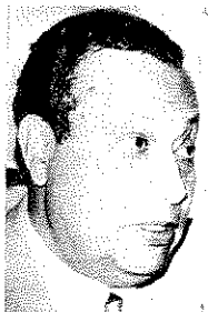
H.E. Dr. Atef Ebeid