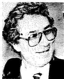
H.E. Dr. Farouk Hosni