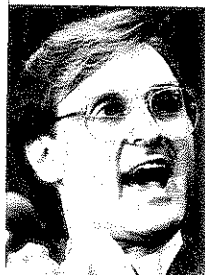
Ambassador Stephen Lewis