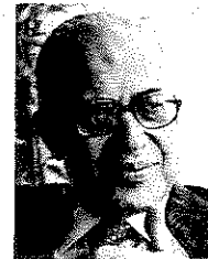
H.E. Dr. E. Abdel Meguid