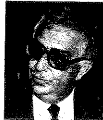
H.E. Eng. Maher Abaza