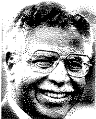
Dr. Mostafa Tolba

Early Co-Sponsors: Ministry of Housing, Physical Planning and the Environment of The Netherlands Stockholm Environment Institute Japan Overseas Environmental Cooperation Center The Environmental Pollution Control Journal (Japan) The William Bingham Foundation Charles Stewart Mott Foundation World Resources Institute The Conservation Foundation/World Wildlife Fund U.S. Environmental Protection Agency U.S. National Climate Program Office U.S. Department of Energy National Institute for Environmental Health Sciences Center for Global Change, University of Maryland GE Foundation Geneva Steel Texaco Philanthropic Foundation Commission for the Future, Australia Greenhouse Action Australia United Nations Development Program Intergovernmental Oceanographic Commission of UNESCO World Health Organization Arab Center for Studies of Arid Zones and Dry Lands