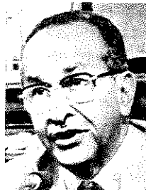
H.E. Dr. Fouad Sultan