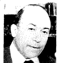
H.E. Dr. Youssef Wally

THREE SIMULTANEOUS PANELS: 11 a.m. - 1 p.m., 2:30 p.m. - 5:30 p.m.