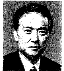
P.M. Toshiki Kaifu

Throughout the Tokyo Conference speakers and participants cited Japan's experience in energy efficiency as a key to meeting global greenhouse concerns. Japan's success in simultaneously achieving population stability, rapid economic growth